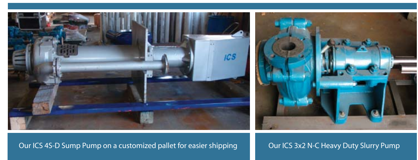
Our ICS 4S-D Sump Pump on a customized pallet for easier shipping